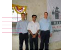
De Beer India