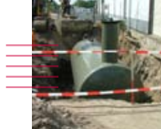
Raw materials tank