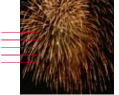
Holidays De Beer