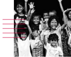
Donation for Orphans