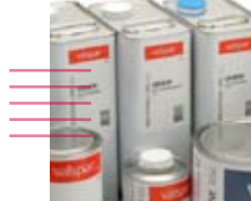
Valspar Industrial line