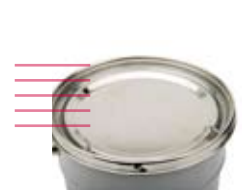
5 litre tin handle