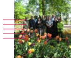
Global colour conference