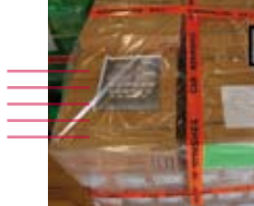
Extra control orders