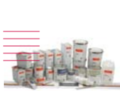
Valspar Industrial Line