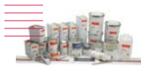
Valspar Industrial Line